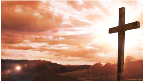
The Holy Cross

No matter what your present status in the Catholic Church, No matter your personal history, age, income, background, gender, race, ethnicity or spirituality, or marital situation, No matter your own self-image of holiness or virtue, You belong to Jesus Christ and you belong to us! You are invited, accepted and respected here at the Parish of Saint Thomas More. Take our hands, Lord Jesus, leading us in courage to confront with courage the forces which oppress and divide. Take our hearts, Lord Jesus, and open them to the truth which will set others free. Accompany us on our way, Lord Jesus, as we seek to share our Roman Catholic faith and life in your Spirit.